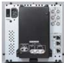
Attached with optional Multi-format HD/SD SDI module IF-C151HDG